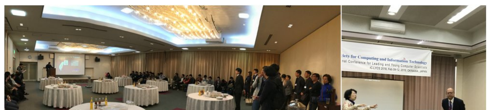
Photo Album from IC-LYCS 2018